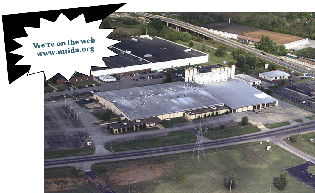
Paramount Packaging Bldg.